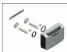
(Wall Mounted kit)